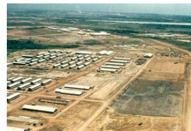
Long Binh from the air 1969