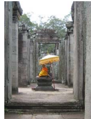
Buddhist monk in the temple complex