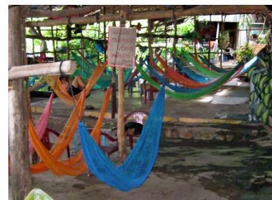
Ubiquitous rest stop along Highway 1