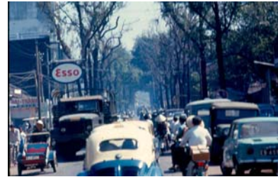
Saigon Street 1969

The taxi to downtown took about an hour, and we were dropped off at the Hotel Continental that as much as anything marks the heart of old Saigon, one of the old French hotels and once the hangout of Graham Green. Although high rise hotels have been planted all