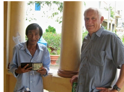
I bought some lottery tickets from this guy in Rach Kien