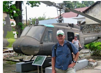
Display at war Remnants Museum