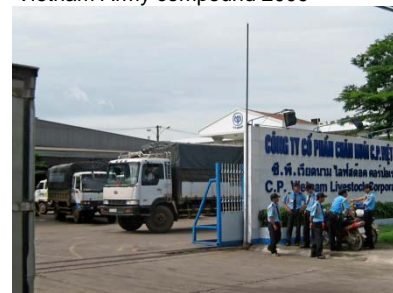
Location of 159 Engineer Group compound at Long Binh is now an industrial facility for the CP Group