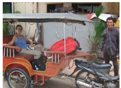
Tuk-tuk in Phnom Penh