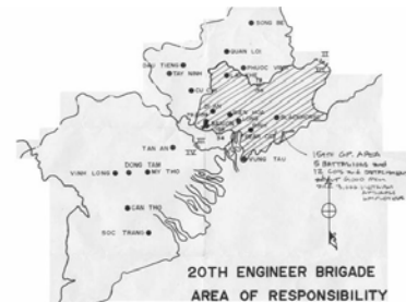
159 th Engineer Group Area of Operations 1969 (cross-hatched)