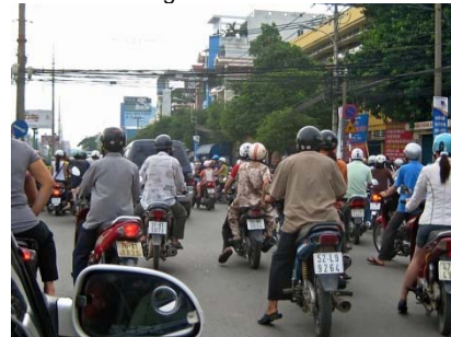
Saigon street 2009