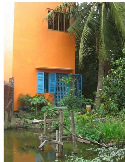
Pond in back of Phuc's Rach Kien home