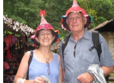
Trying on hats in Chiang Dau