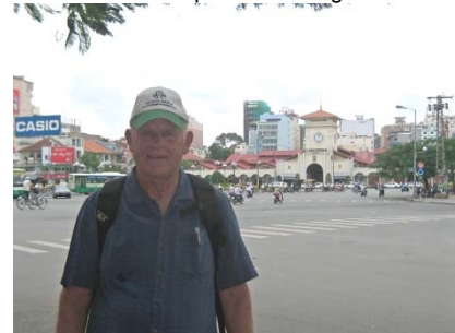
Ben Than market, Saigon