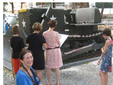
U.S. Army Engineer bulldozer on display at War Remnants Museum 2009