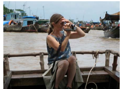
Cai rang Floating market in Vinh Long