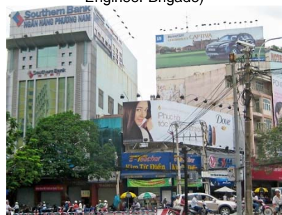
Streets of Saigon 2009