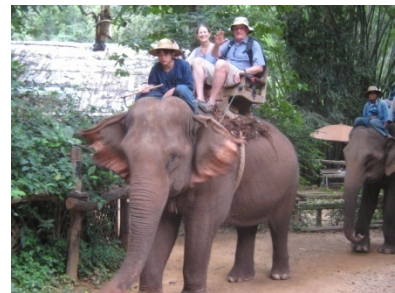
Riding the elephant in Chiang Dau