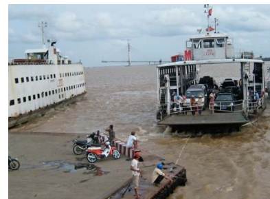
Crossing the Mekong at Can Tho