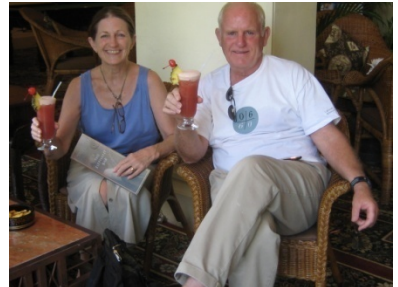
Welcome drink at Raffles Hotel le Royal in Phnom Penh