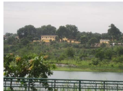
USARV buildings used for Vietnam Army compound 2009