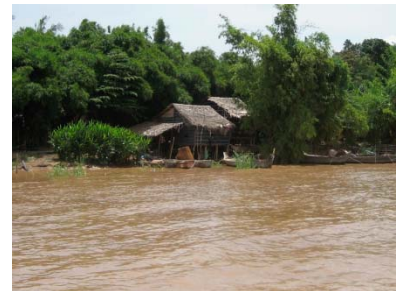
Mekong River in Cambodia