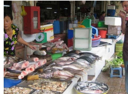
Ben Thanh Market