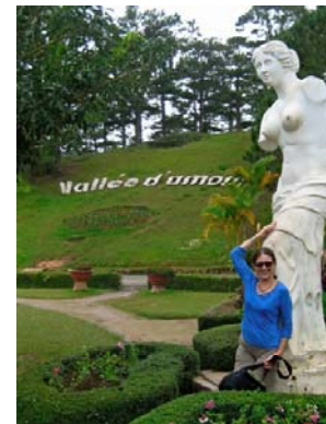
Valley of Love, Dalat

Our guide is about 30 years old, originally from Danang but now living in Saigon. His family were Viet Minh sympathizers during the French war, and when Diem came to power after the partition, the government had his uncle