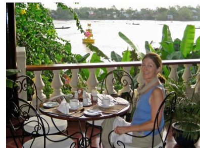
Breakfast at the Hotel Victoria on the Mekong in Chau Doc