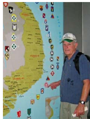
Display of American military units in War Remnants Museum (pointing at 20 th Engineer Brigade)

I was assigned a room in a "hootch," which was, in this case, about 10 feet by 15 feet in a long building originally constructed with louvered walls and wire insect screen. It was a double row of such rooms, each with outside entrances, all assigned to officers. The roof was corrugated steel. Because the engineers were good at snagging stuff, it had a window air conditioner, and like the other rooms, the original louvers on mine had been covered with plywood. That air conditioner ran, without respite, until the day I