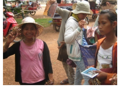
Kids selling souvenirs

Global warming and sea level rise is a big concern in this part of Asia. Hey say Vietnam is the fifth most vulnerable country in the world, primarily because of its agriculture rich but low lying deltas.