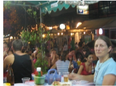
Dinner on the Street on Soi Rambutri in Bangkok