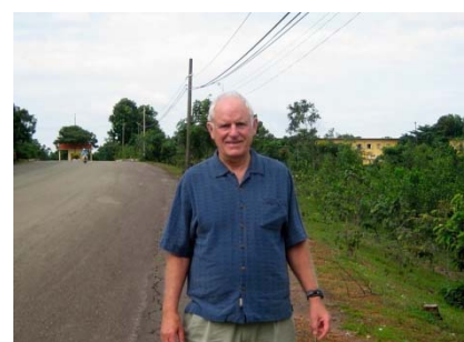
Guard gate to military installation at former USARV compound at Long Binh