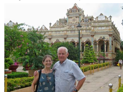
Vinh Trang Buddhist pagoda (built in 1849)