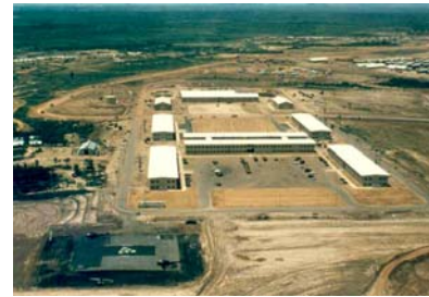
United States Army Vietnam (USARV) Headquarters, Long Binh, 1969

Historical Note: In response to the buildup of U.S. forces in the Republic of Vietnam, the 20th Engineer Brigade Headquarters was reactivated May 1, 1967, at Fort Bragg, North Carolina, and deployed to Vietnam in August 1967. During the Vietnam conflict, the Brigade numbered over 13,000 officers and enlisted men organized into three engineer groups, with 14 battalions and 31 separate companies and detachments. The Brigade provided all non-divisional engineer support in Military Regions III and IV during eleven campaigns. Units cleared more than one-half million acres of jungle, paved 500 kilometers of highway, and constructed bridges totaling more than six miles in length. As US forces were withdrawing from Vietnam, the Brigade was inactivated September 20, 1971.