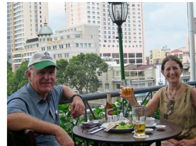
Rooftop restaurant, Rex Hotel 2009