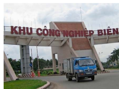
Entrance to industrial park at former location of Long Binh