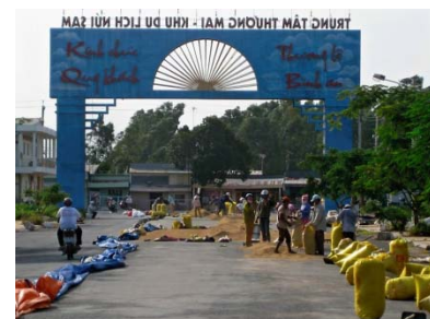
Drying rice in the road