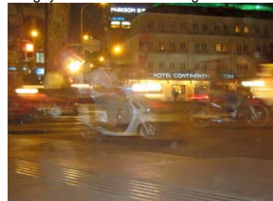
Hotel Continental at night