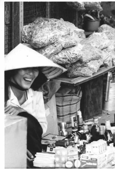
Sidewalk peddler 1969

Most of what was the headquarters for the U.S. military in Vietnam and the home of about 75,000 soldiers in an area almost as large as Richmond is now an industrial and business park. When I was here 40 years ago, I don't think there was a tree in sight, but the jungle has returned with a vengeance. Trees and grass are everywhere. The only thing left is the cluster of buildings on a hilltop that once housed the headquarters of the United States Army Vietnam (USARV). It and the area around it have been taken