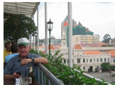
City Hall from Rex Hotel rooftop 2009