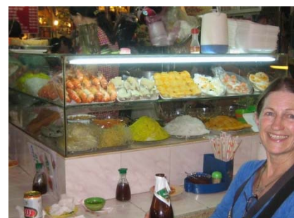
Lunch at Ben Thanh Market