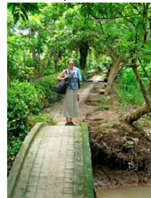
Lunch stop on an island