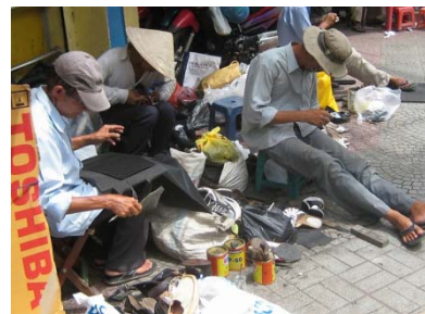
Sidewalk cobblers 2009