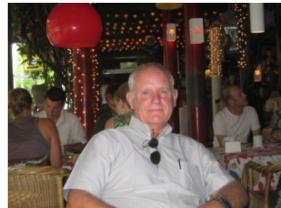
Bar on Soi Rambutri in Bangkok