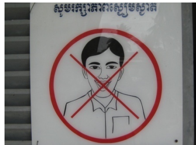
No smiling or laughing allowed at the Genocide Museum in Phnom Penh