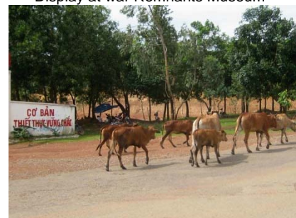
Running cattle at former Long Binh Post