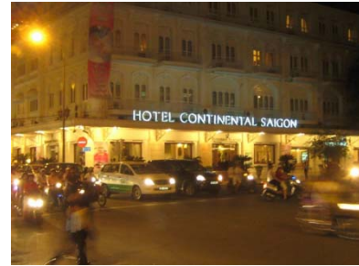
Continental (Palace) Hotel in 2009

As I mentioned before, I got my first glimpse of the