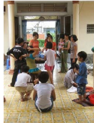
Kids waiting for lunch at Rach Kien

The 159th HHC compound was located adjacent to QL-1, the main highway from Saigon. To get there, you entered the main Long Binh gate, turned left about a block. Between the compound and the highway, maybe 200 feet, was a wall of sand-filled 55-gallon drums and sandbags and lots of barbed wire. It may also have been mined. Further on, just down the hill and adjacent to the 159th compound was the 46th Engineer battalion compound. They had a really nice swimming pool.