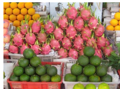
Dragonfruit at Ben Thanh