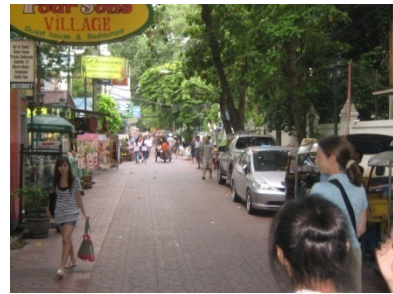
Soi Rambutri in Bangkok

Tomorrow we head back to Saigon for our last day in Aisa before flying home.