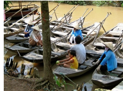
Waterway near Can Tho

After Nui Sam, we were back on the water visiting a huge houseboat community on the Mekong devoted to fish farming. Each large houseboat is also a floating fish farm where fish are fed pellets of food made from fish scraps, rice powder and water morning glories. These folks are ethnic Vietnamese who had settled in Cambodia but were driven out by the Pol Pot