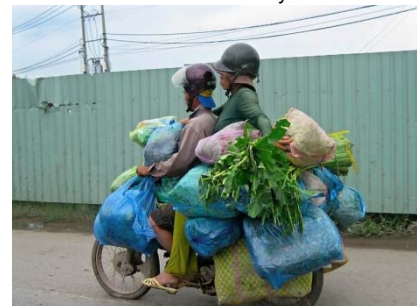
Going to market on two wheels