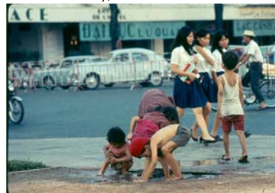
In front of Continental Palace Hotel in 1969