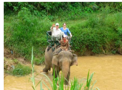
Riding the elephant in Dalat