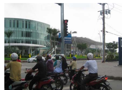
Saigon South on the way to the Delta