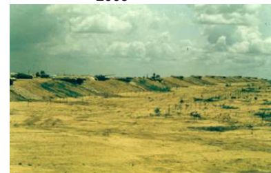
Long Binh perimeter berm 1969 with 175 mm guns