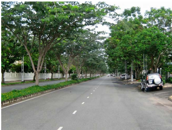
Left and below, the new "Saigon South"