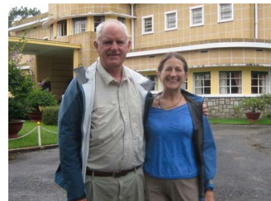
Bao Dai's Summer Palace, Dalat

On an overcast and rainy Monday, we booked a tour of the local attractions.