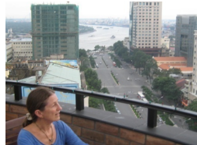
From a hotel rooftop looking south along Nguyen Hue over the Saigon River