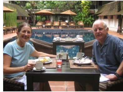
Tamarind Village Hotel in Chiang Mai