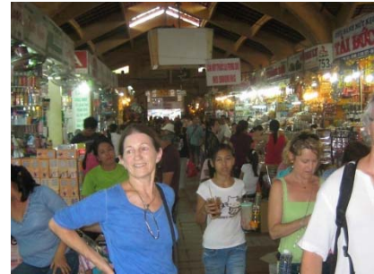
Inside Ben Thanh Market

I've finally arrived to a permanent location, got a job, etc.