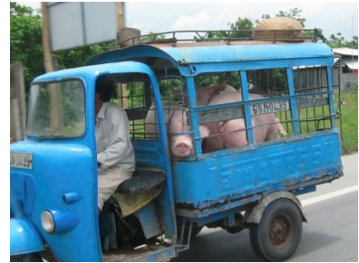
This little pig went to market

We are now in our hotel in Can Tho with an early morning wakeup to get the local floating market while it is most active.